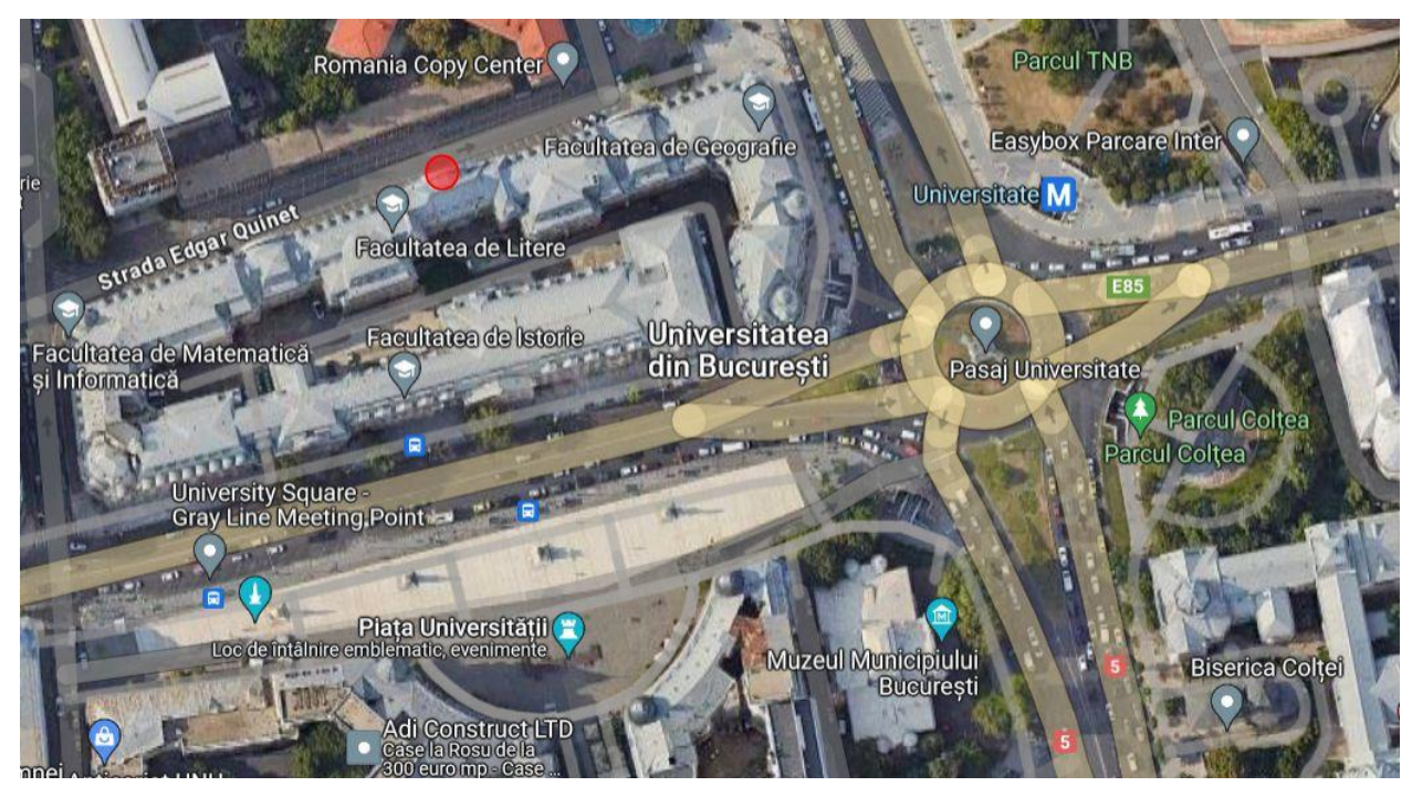
University of Bucharest – Bd. Nicolae Bălcescu Nr. 1, Sector 1, București entrance (Edgar Quinet St.)